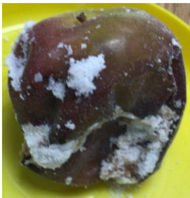
Mummified apple – we used a baking soda and salt mixture to remove moisture from the apple.