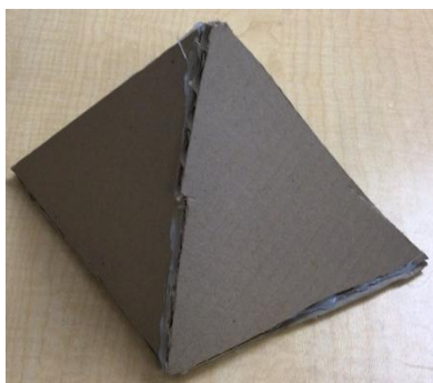
Pyramid with artifacts